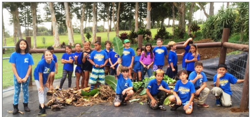
The 4th grade gathers in front of some compost in the new compost yard.

Organic waste from the school garden, pre-meal vegetable waste from the school kitchen, banana leaves and leftovers from cooking classes and the school vegetable/fruit snack program will make up the compost, which will be organized in windrows. The great thing is that not only will the compost be used to provide nutrition to plants in the garden, it will serve as